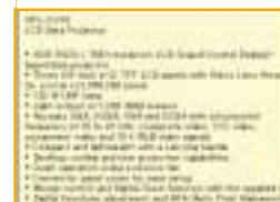
4-times Digital Zoom